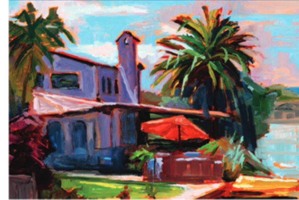
Cover art: The Red Umbrella 12"x12", oil on hardboard. Private collection.

SF on the Bay is committed to furthering community efforts towards Climate Action initiatives. Big change starts small! Please join us. Subscribe at slonthebay.com/clean-waters